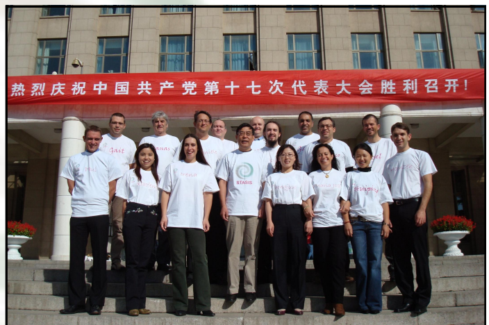
■ Family photo taken outside Tsinghua University, Beijing, 2007

In September STASIS was presented at the Framework 6 ESSG Concertation Event in Brussels, which brought together projects from the Software and Grid Technologies units. At the event we established links with the Ontologies Group, which is of particular relevance to STASIS.